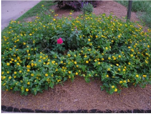
Before Hurricane Ike

On September 13, 2008, Hurricane Ike tore through East Texas with sustained winds of 60 mph and gusts up to 80 mph. Although this area experienced these high winds for approximately 6 hours and there was widespread and extensive damage to trees, the photos below show my pine straw mulch did not blow away or even get disturbed. The debris you see in the “After Hurricane Ike” photos is from the leaves that were stripped from the trees during the many hours of high winds. They can easily be swept away by hand, broom, or leaf blower.