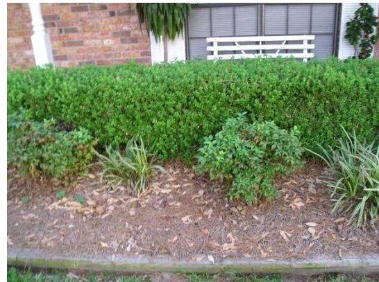
After Hurricane Ike