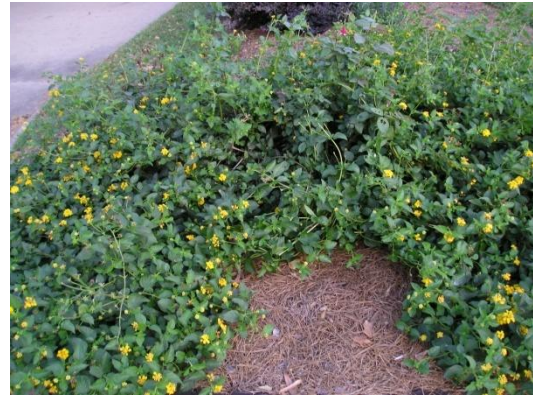
After Hurricane Ike