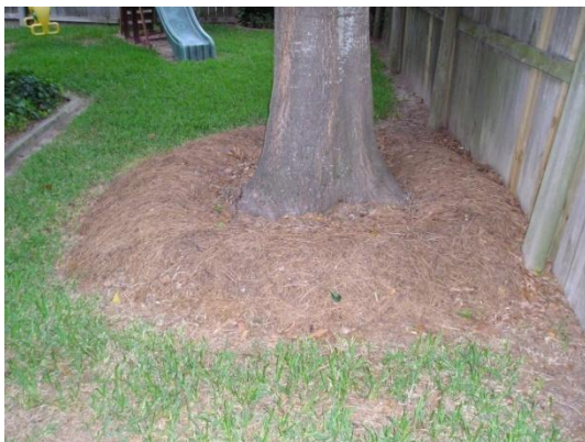
Before Hurricane Ike