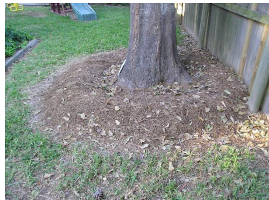
After Hurricane Ike